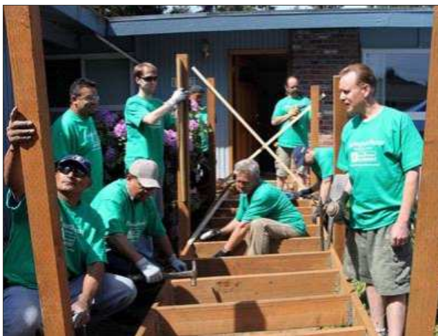
Photo: Master Builders Association volunteers work as a 'Rampathon' team to build free wheelchair ramps for disabled homeowners. Since 1993, MBA Care Foundation volunteers have built more than 300 wheelchair access ramps in King and Snohomish Counties.

Comprised of more than 3,300 companies, the Master Builders Association is the nation's oldest and largest local home builders association in the nation.